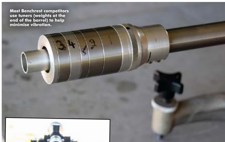
Most Benchrest competitors use tuners (weights at the end of the barrel) to help minimise vibration.