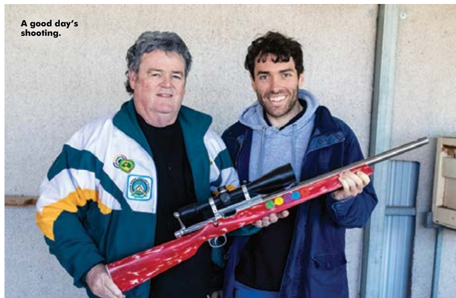
A good day's shooting.

To give a basic idea, the reloading process starts with taking your used brass