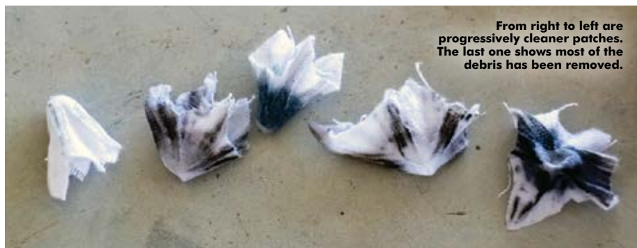
From right to left are progressively cleaner patches. The last one shows most of the debris has been removed.

group was effectively doubled. Oh well, it was still a decent group.