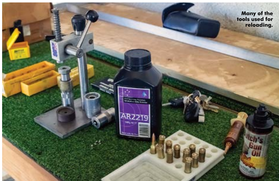
Many of the tools used for reloading.

After practice it was time for real competition. I was given two targets to shoot the best grouping I could and after a couple of sighting shots was ready to attempt my first group. I can't stress how good my first four shots were. Unbelievably good. All four almost went through the bullseye and barely broke any excess paper after the first shot. Thinking I'd just about mastered Benchrest I took my fifth shot exactly as I thought I had the first four but to my shock it flew high and wide and the size of my