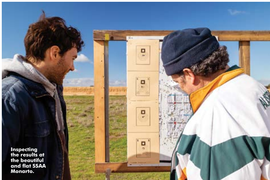
Inspecting the results at the beautiful and flat SSAA Monarto.

For centrefire shooting I used Brendan's custom-made firearm from the US. The striking red rifle was completed with a two-ounce trigger, Kelby stock, Stolle action, 60x power March scope and of course uses the 6PPC cartridge, Brendan explaining this is considered the most