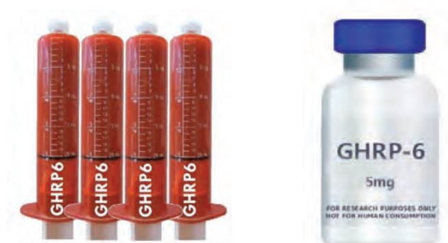
FIGURE 1: GHRP-6 transdermal cream (on left) and GHRP-6 solution for injection (on right)

Most peptides are listed under Schedule 7A Item 3 of the Customs (Prohibited Imports) Regulations 1956. Further, under Regulation 5 of these Regulations, Schedule 7A substances are classified as prohibited imports unless the importer has a permit to import issued by the TGA.