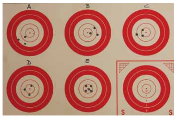
A demonstration target of sighting-in with three-shot groups. A is the original setting, B shows too much adjustment, C is too far left and D is about right. E is what we are looking for!

Your rifle will be fitted either with open sights or a telescopic sight. These are the two most common aiming methods. Open sights are usually made of metal and consist of a front-sight near the end of the barrel and a rear-sight usually fixed to the barrel just in front of the action. The front-sight can be a small bead or perhaps an upright blade and often has a hood over it to protect it from being damaged or put out of alignment during use. The rear-sight can be a simple arrangement using a 'V' or 'U' section cut into the metal, with the advantage that it can be adjusted for both vertical and horizontal movement. By looking down the barrel, it is a simple matter to 'sit' the front-sight into the groove in the rear-sight and aim at your target. More sophisticated versions are fitted to target-type rifles, but the principles remain the same.